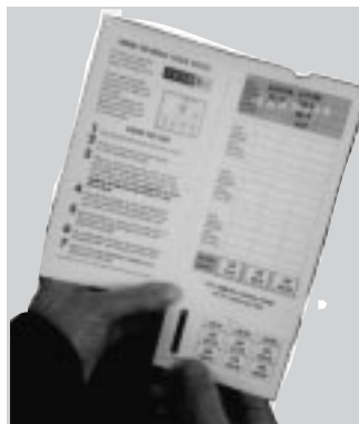
Some resources are available at no cost. This meter beater, used to estimate how much gas is used daily, is free from the Gas Consumers' Council.