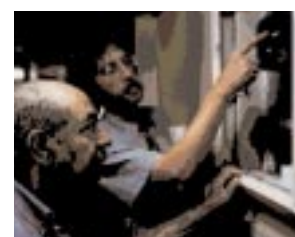
Home visits allow an adviser to assess individual needs and give householders specific advice. Understanding meters is essential for budgeting and checking bills.

There may also be significant cultural differences which affect the way ethnic minority communities access and use services.